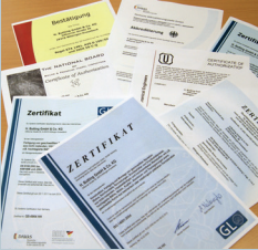
European and American standards