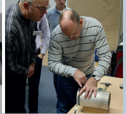
Introduction to quality control