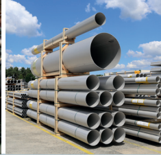
A "perfect" inquiry for pipes