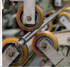
Introduction to surface structure and technology