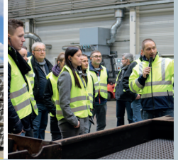
Guided plant visit