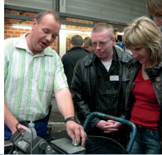
Non-destructive material testing