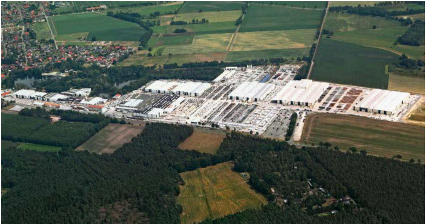
BUTTING in Knesebeck today: Progress by Tradition – for our customers and employees in this and the next generation

or is all of this an expression of the oppression of women and thus a breach of human dignity? We can only answer such difficult questions with self-awareness and self-confidence.